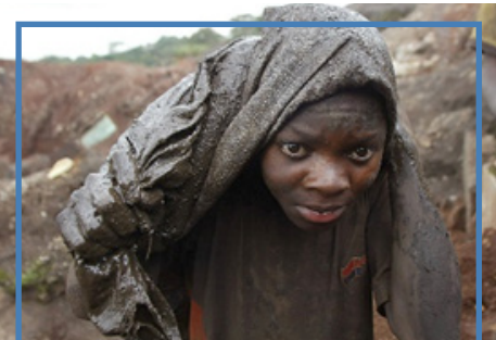
A young person carries wet cobalt on his back at the Shinkolobwe cobalt mine in Democratic Republic of Congo.

fueled vehicles, gas appliances and wood-burning stoves while driving up electric bills. It’s time to extract Virginia from these boondoggles.”